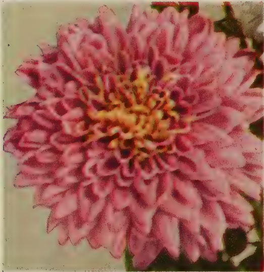
TIME. $1.00 each; 3 for $2.50